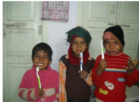
Some of the Give Kids a Smile recipients of our oral hygiene products in India